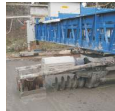
PAN Vibrator (Optional)

KYB - Conmat manufactures exclusive range of standard and customized high performance Paving Machines for slopes as well as horizontal surfaces. These world class products are characterized by high efficiency, reliability, as well as solidity. Our dedicated team of engineers ensure excellent support right from installation to commissioning and after sales service.