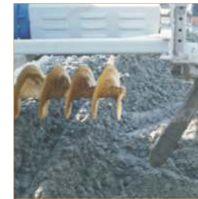
Needle Vibrator (Optional)