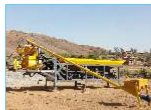
Mobile Batching Plant