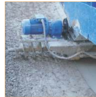
Extra Long Hardened Auger