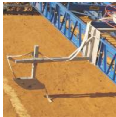
PVC Water Stop Atch. (Optional)