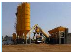
Concrete Batching Plant