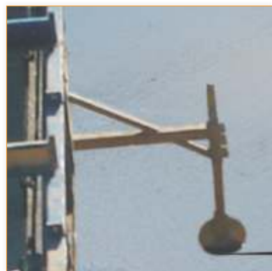
Groove Cutter (Optional)