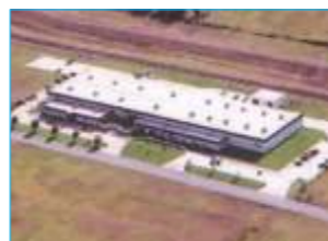
TSW Products - USA