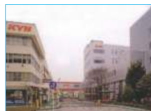
Sagami - Japan